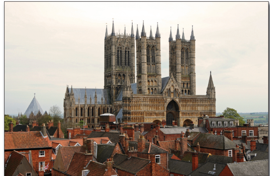
Lincoln Cathedral towers above the roofs of Bailgate, as seen from Cobb Hall.