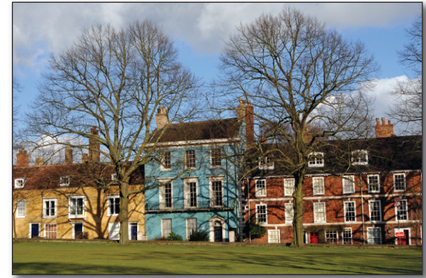
These attractive houses on Minster Gate form part of the Cathedral Close.