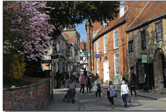
The final walk from Steep Hill leads to the open area of Castle Hill.