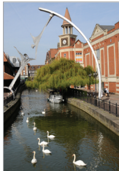
The Millennium Empowerment sculpture spans the River Witham in front of the Waterside Centre; its design was based on turbine blades reflecting the City's industrial past.