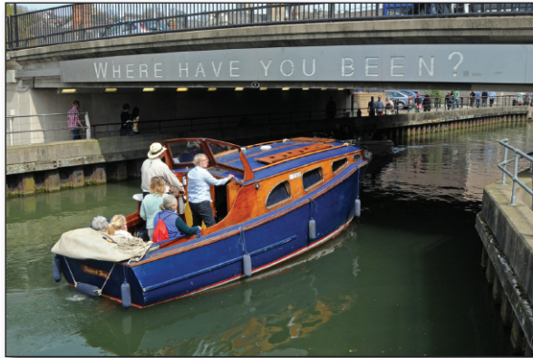
Holidaymakers negotiate the low bridge of Wigford Way Flyover as they make their way from Brayford Pool along the River Witham.