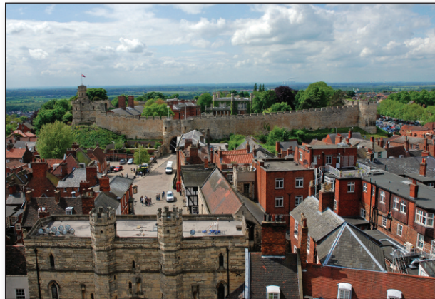
Take a guided roof tour of the Cathedral and be rewarded with memorable views over Exchequer Gate to Castle Hill and the Castle beyond.